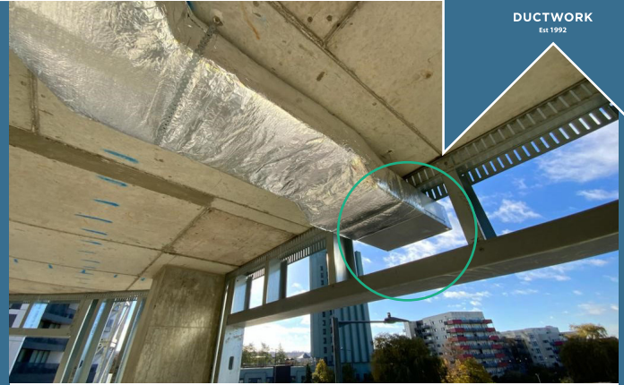
Image shows 300 x 100mm ResiDUCT™ A1 rated ductwork (insulated) to termination point. (as per client provided drawings)

The A1 rated ductwork is directly connected to the standard PVC ducting used (e.g. 220 x 90mm) at the slab level, through the cavity wall and then dropped to meet the desired termination position on the facade wall.